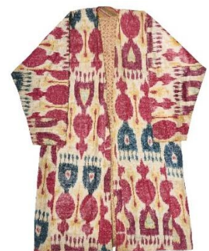
An ikat Chapan, Uzbekistan, late 19 th century £300 - £500