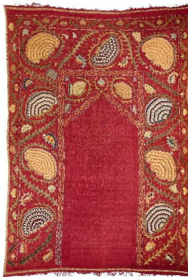
A Shakhriyabz niche panel, Uzbekistan,

Uzbekistan, second half 19 th century c. 184 x 124 cm £2,000-3,000