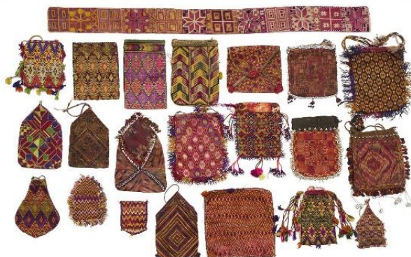
A collection of embroidered purses and pouches, Hazara, Afghanistan, late 19 th /20 th century. £400 - £600