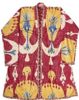
A boy's ikat Khalat, Bokhara Uzbekistan, last quarter 19 th century. £300 - £500